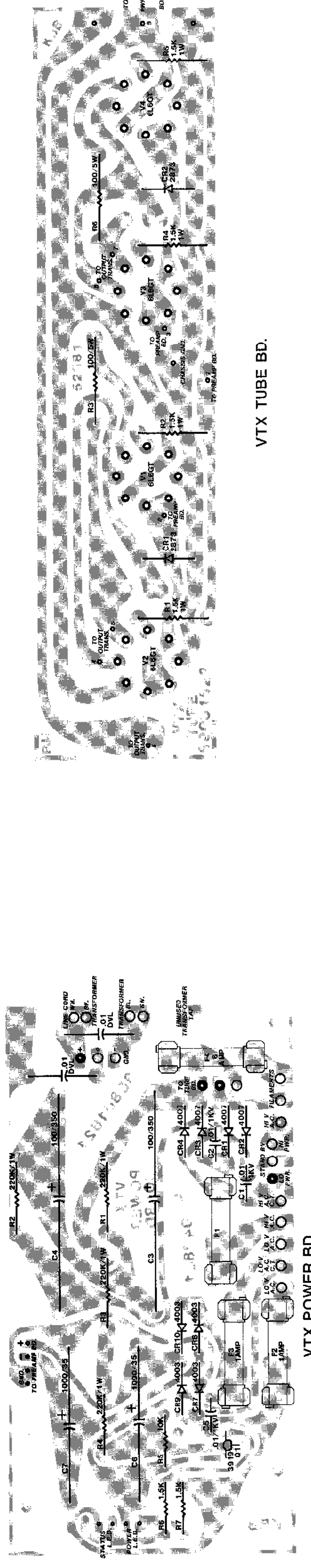
VTX TUBE BD.